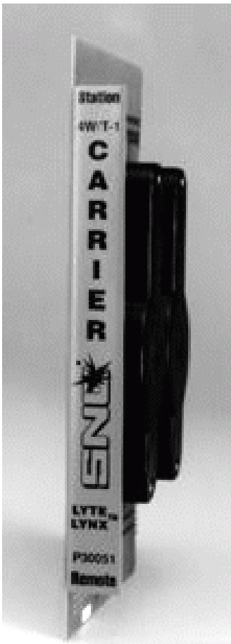
Figure 1: Photo of P30051 4-Wire DS1 Isolation Card