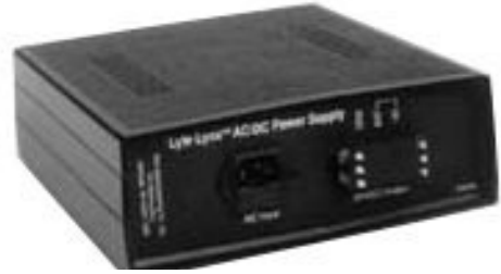
Figure 1: P30059

This document describes the technical specifications, technical requirements and installation instructions for the P30059, SNC Lyte Lynx® 120VAC/ 130VDC to 24VDC external power supply. It provides an understanding of the basic functions and features available with this product.