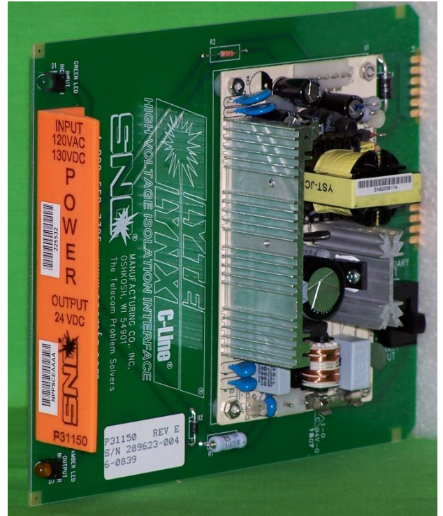
Figure 1: P31150