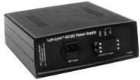
Figure 1: P30102

This document describes the technical specifications, technical requirements and installation instructions for the P30102, SNC Lyte Lynx® 120VAC/130VDC to 48VDC external power supply. It provides an understanding of the basic functions and features available with this product.