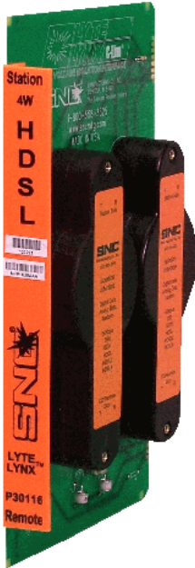
P30116 4-Wire HDSL2/56kbs Data Isolation Card