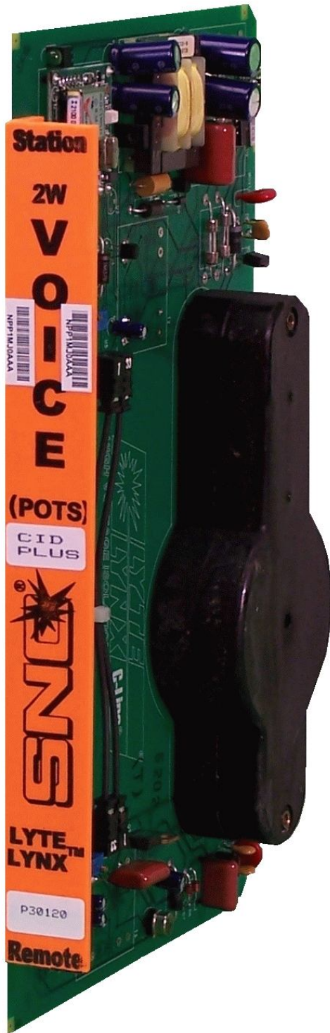
Figure 1: P30120

* Teleline Isolator is a trademark of Positron Industries, Inc.