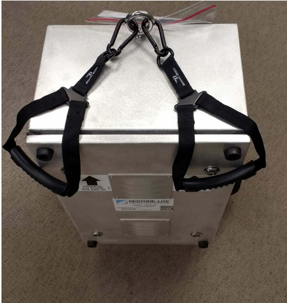
Handles attached and ready for lifting

2. Attach clip to Restore-Lite ® to use handle kit.